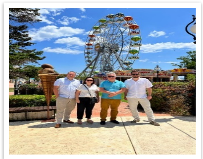
EC EMME Team and ERV Evropská (Czech Republic) at Viva Clinic

We are confident that our meeting with the international department of the public hospital in Burgas will lead to an improvement in the cooperation challenges that is sometimes experienced between the local public sector and private international insurances.