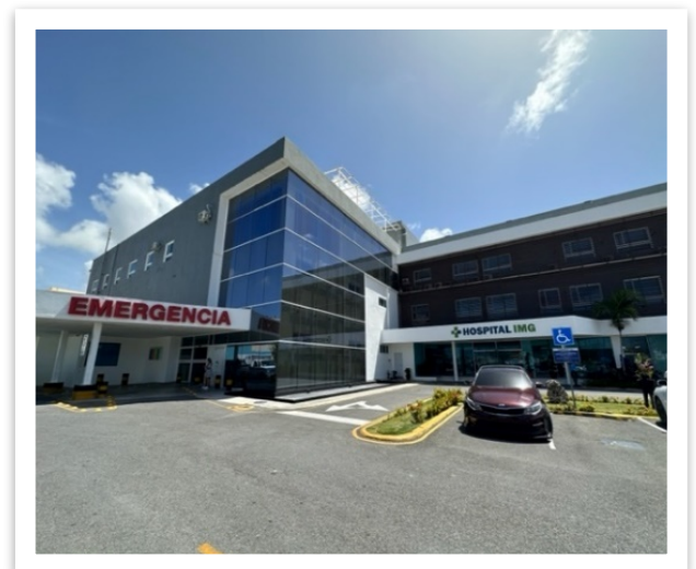
IMG Hospital in Punta Cana